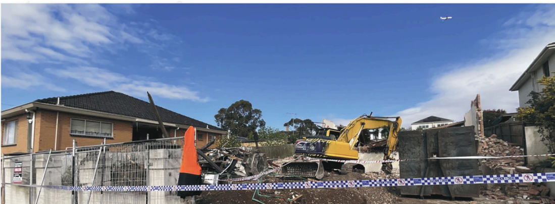
Figure 1: Incident scene at a demolition site

As a duty holder you have legal obligations. For more information, scan the QR code or visit: worksafe.vic.gov.au/safety-alerts/employee-killed-when-concrete-floor-collapses-demolition-site .